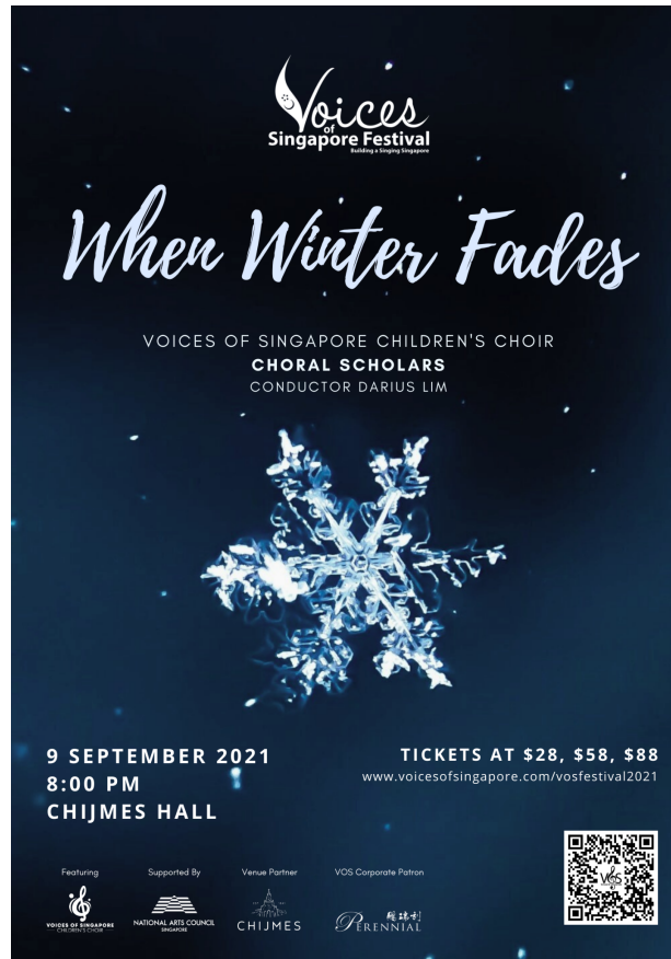
Above: Official Poster of “When Winter Fades”