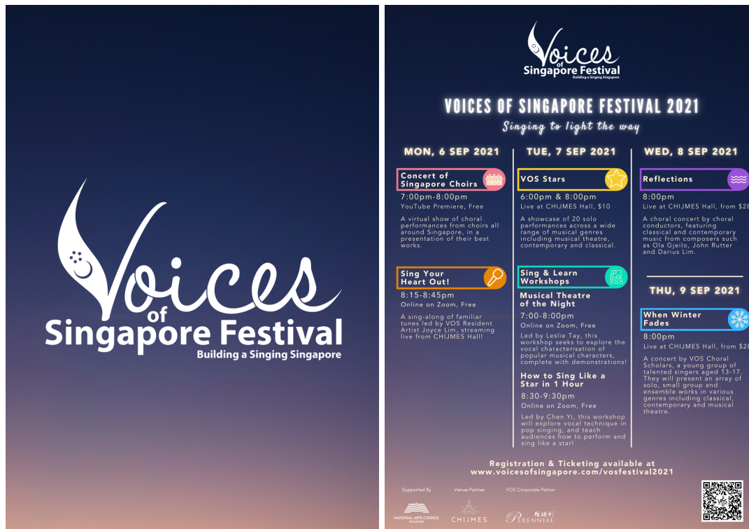
Above: Voices of Singapore Festival 2021 Official Poster and Festival Lineup

Designed to take audiences on a journey of music and life from stories of the cold and tranquil winter to the fiery warmth of summer. The one and a half hour show will consist of an assortment of arrangements from solos to larger groups, highlighting the individual and shared talents of these young artists. The Choral Scholars will perform an array of pieces across contemporary, musical theatre and classical genres.